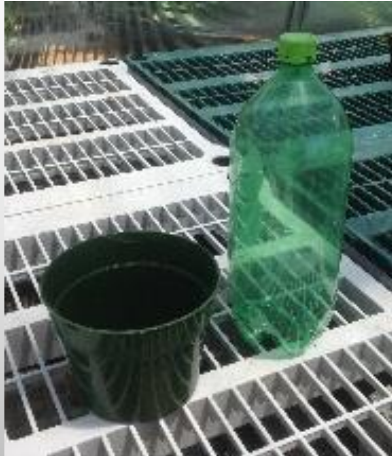
Green plastic soda bottle with lid