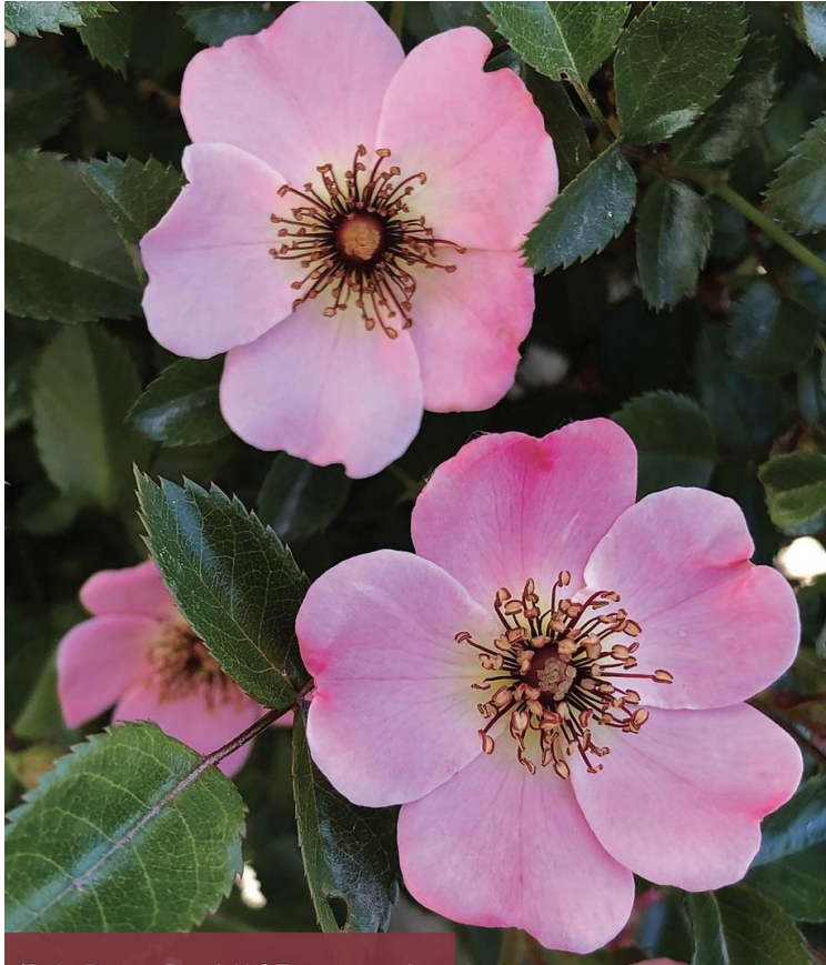
'Baby Dainty Bess' (AOE #2020-03)