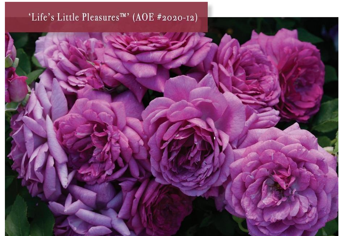
'Life's Little Pleasures™' (AOE #2020-12)