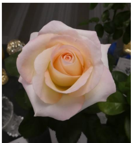
Queen of Show