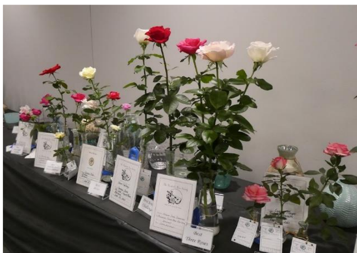
2021 Nashville Rose Society Rose Show Winners Tables